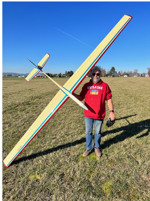
Tom Brightbill proving 30+ year old sailplanes can still fly!