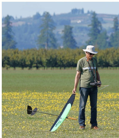
pass_september - Overall Results [st_paul 9/30/2023]